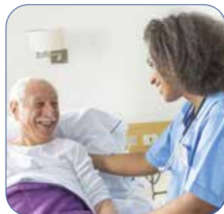
Quality programs that get you hired!