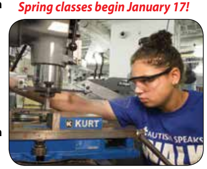
AMTC graduates are being hired by area manufacturers. Learn how you can be hired, too!

Graduates are prepared to work on the shop floor with knowledge in blueprint reading, manufacturing processes and CNC. They have over 400 contact hours with state-of-the art machinery.