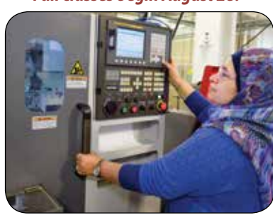
AMTC graduates are being hired by area manufacturers. Learn how you can be hired, too!

Graduates are prepared to work on the shop floor with knowledge in blueprint reading, manufacturing processes and CNC. They have over 400 contact hours with state-of-the art machinery.