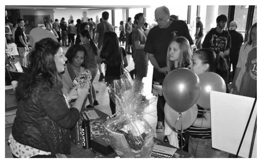
Space is limited! Reserve your spot today!