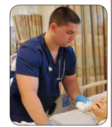
Quality programs that get you hired!