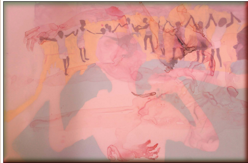
"All for all" Artist: Leslie Jimenez 2012, Ink, Watercolor & Acrylic on acetate