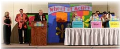
2005 "The Game Show Murders"