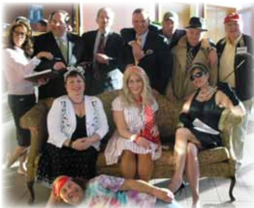
2007 "The Backstage Murders"