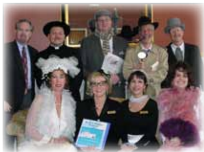
2008 "Suspicious Crossings"