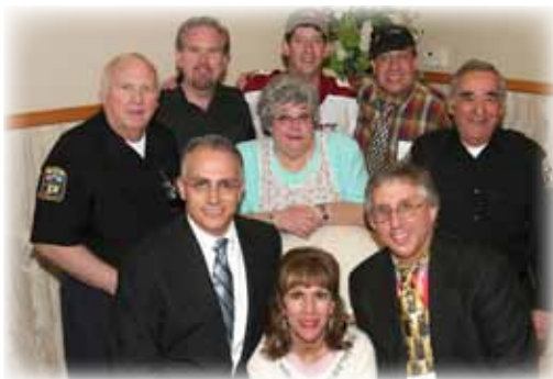
2006 "Murder at the Class Reunion"