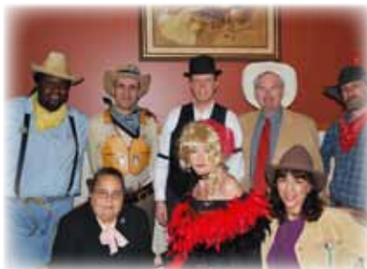
2009 "Mystery Rides Again"