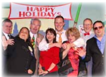
2010 "Who Killed the Boss?"