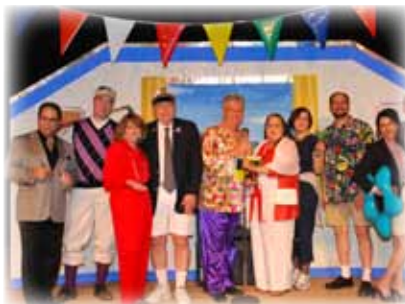
2011 "Murder on the Luv Boat"