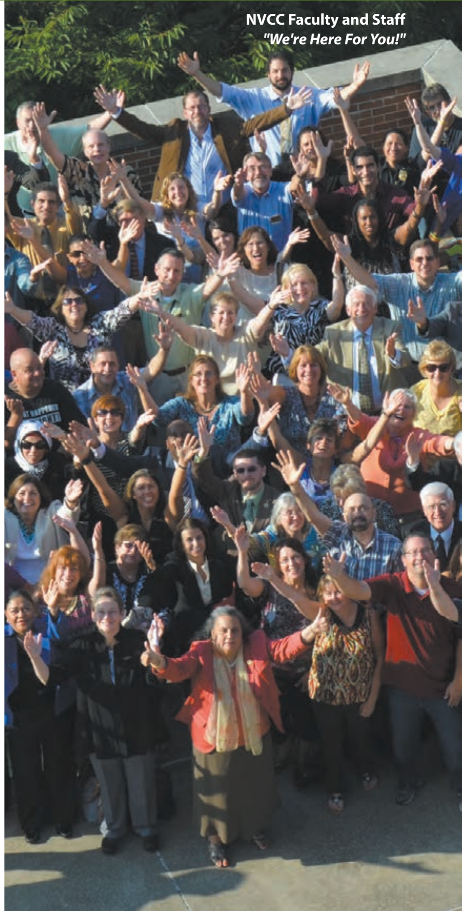
NVCC Faculty and Staff "We're Here For You!"