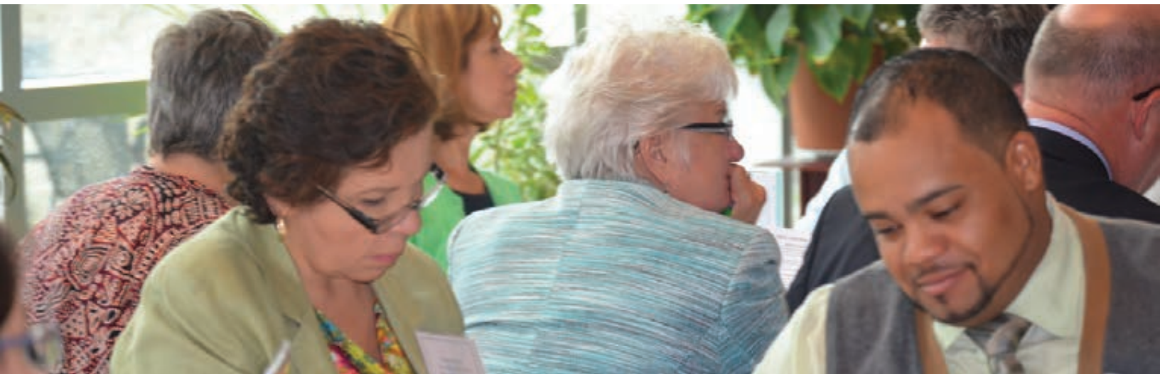
NVCC Community Meeting: "Partnerships for Progress" June, 2013