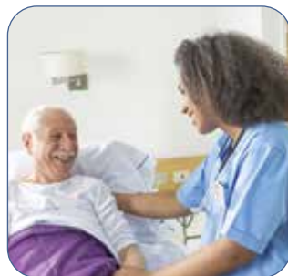
Quality programs that get you hired!