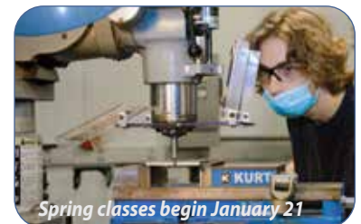
Spring classes begin January 21