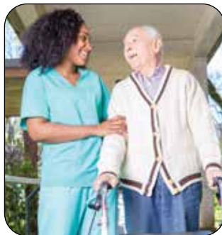
Quality programs that get you hired!